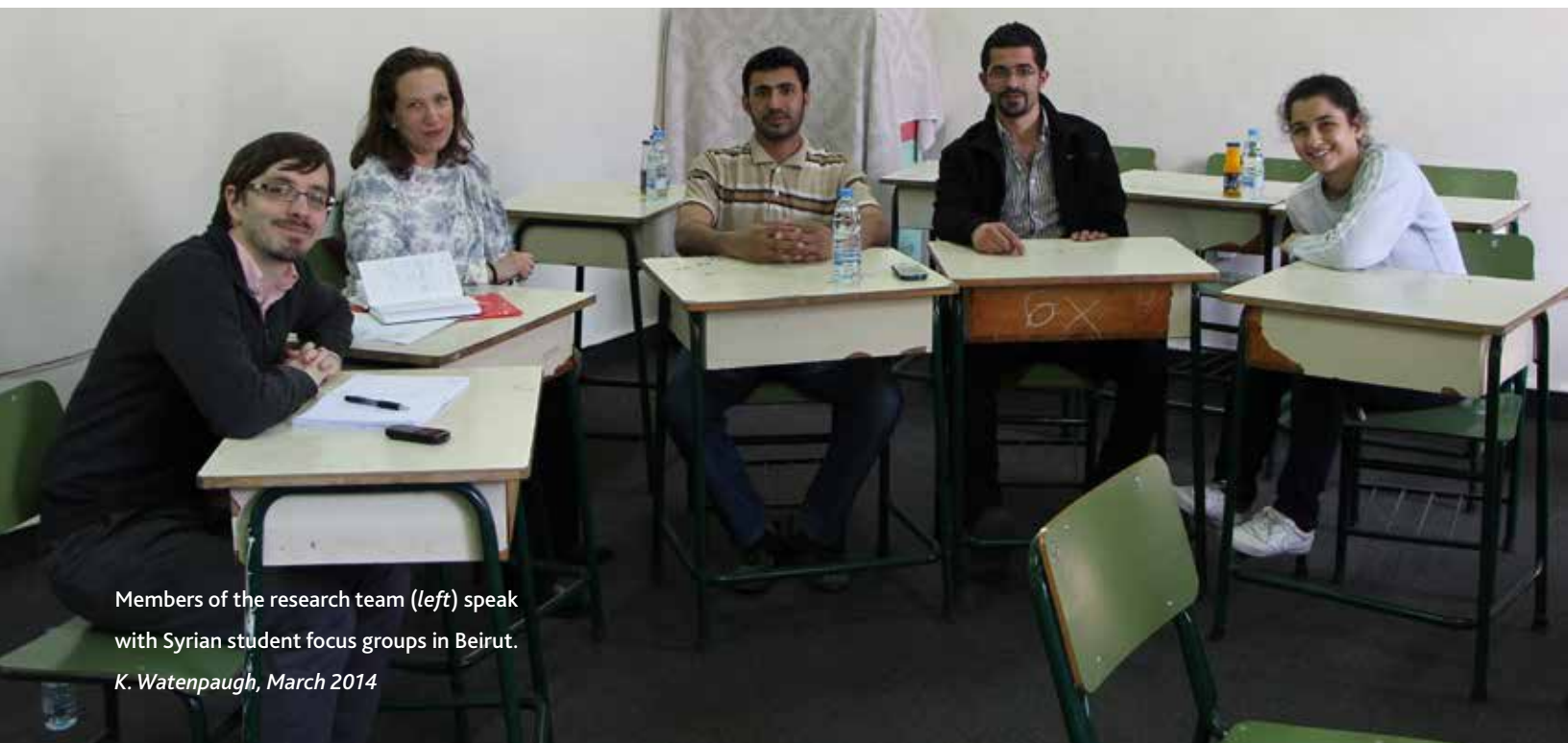
Members of the research team (left) speak with Syrian student focus groups in Beirut.

As in our 2013 research in Jordan, we identified and met with three broad categories of displaced Syrian university students from among the university-age Syrians in Lebanon: students with means; urban students at risk; and informal camp-based students. The team also met with a number of well-off Syrian young people whose families were living outside of Syria in countries like the United Arab Emirates or the United States. These students did not identify as displaced, and they experienced relatively less fear and loss than their peers.